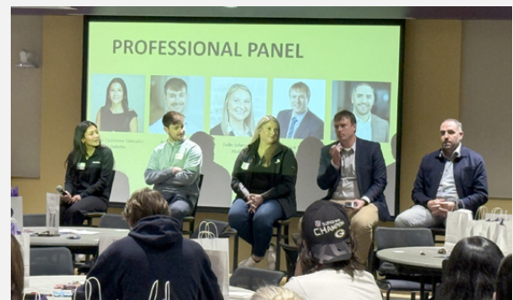
Panelists at Accounting MythBusters Event