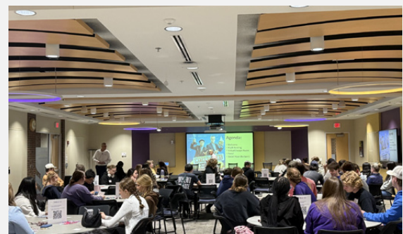
Accounting MythBusters Recruiting Event