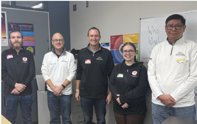
Visit to Lakeville North High School