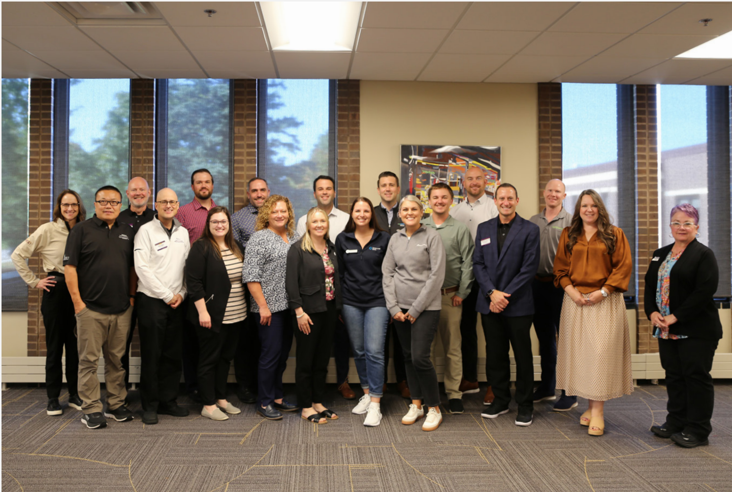
Accounting Advisory Council and Faculty