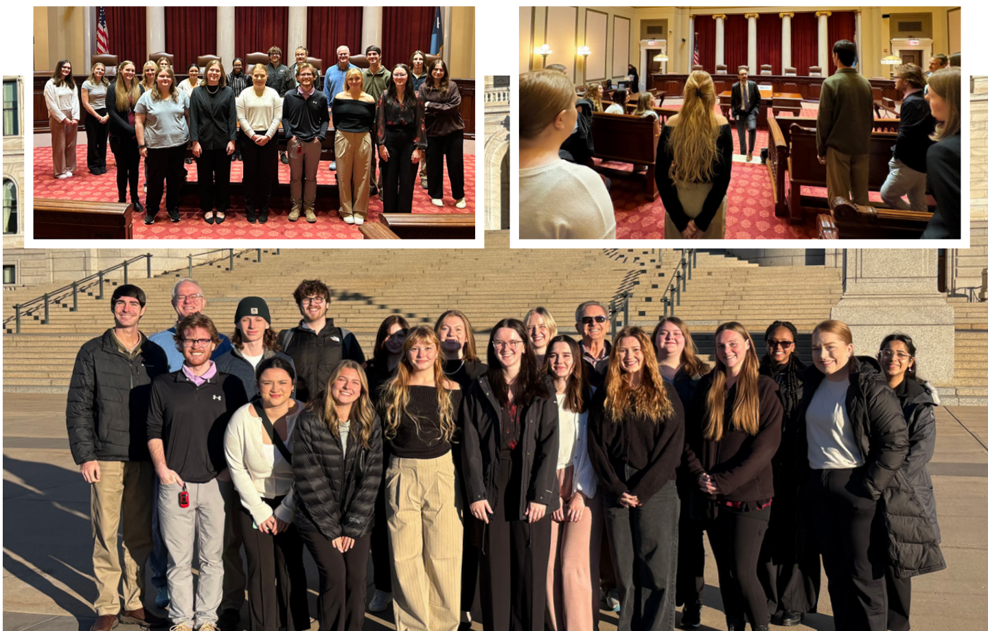
Business Law students visiting the Minnesota Supreme Court

To support these types of high-impact experiences for our students, the Business Law program has launched a new student organization—the Business Law Association—and established the Business Law Foundation. To support the Business Law Foundation, visit: http://link.mnsu.edu/supportbusinesslaw