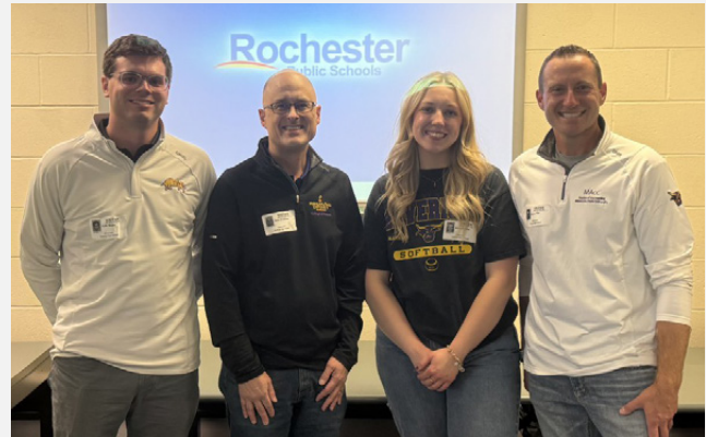
Visit to Century High School